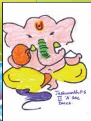
Jashwanth P S - III