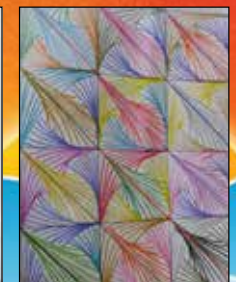
RAHUL N - VIII