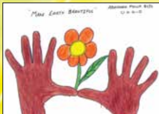
ABHISHEK P - UKG