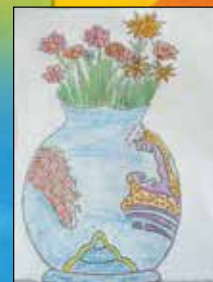
UJWAL - VII