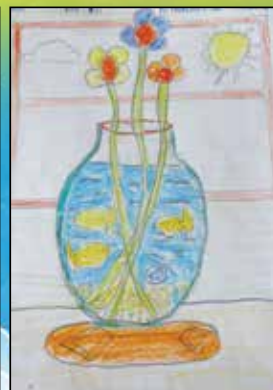
PRAHLAD A - VII