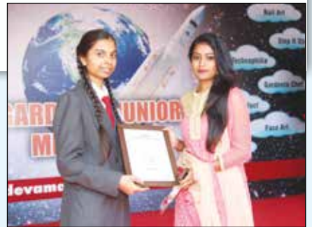
DMCS student felicitates Chief Guest during a School Event