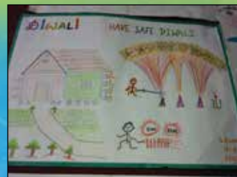
S. KUSHAL - IV