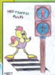
HARITH - UKG