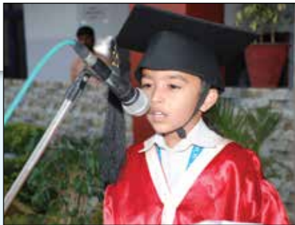
Public Speaking Skills