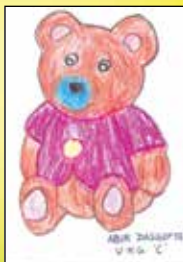
ABIR DASGUPTA- UKG