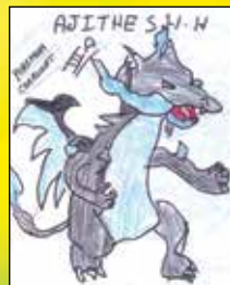
AJITHESH H. - III