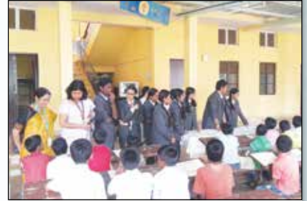
The Midas Touch of Humanity!