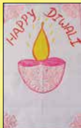
JANET - IV