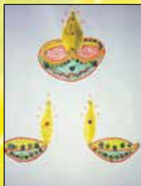
G BRINDA - III