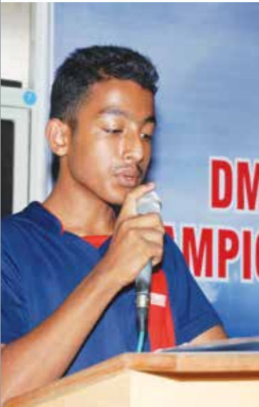
Inculcating true Sportsmanship