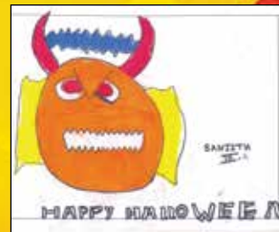
SANJITH - III