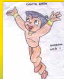
B S KRISHA - UKG