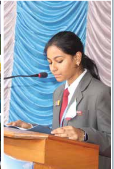
Conferring the Vote of Thanks