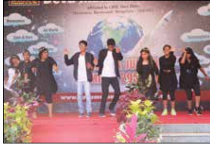
Indigenous DMCS Dance Choreographers