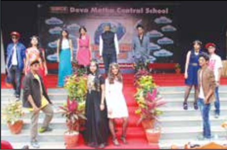
Warm Hosting- Inter School Fest