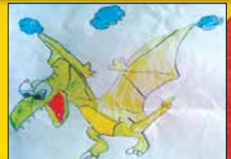
ASHISH THOMAS - III