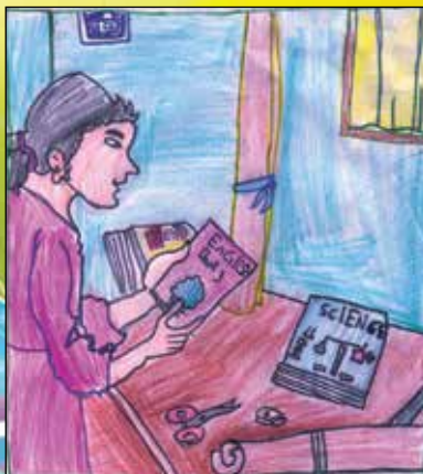
NABIL - III