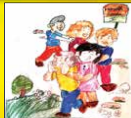
HEMANTH GOWDA - V