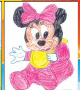
RIFQ S - II