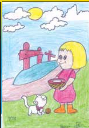
POORVI M. BADIGES - IV