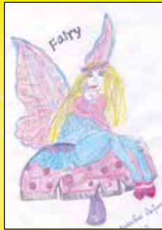
Syed Ayeesh Anjuman-UKG