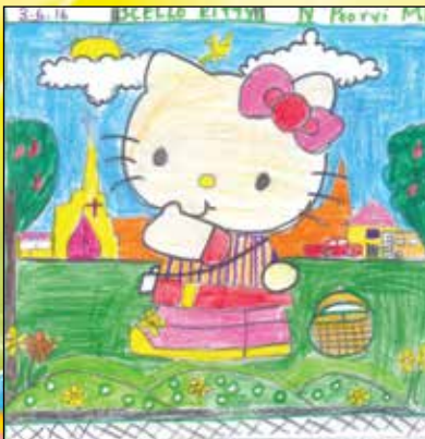
Poorvi M B - IV