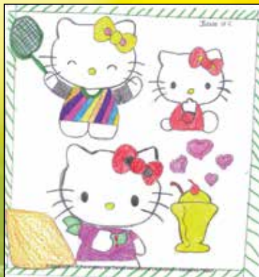
Jessie - IV