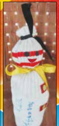
Spoorthi - VI