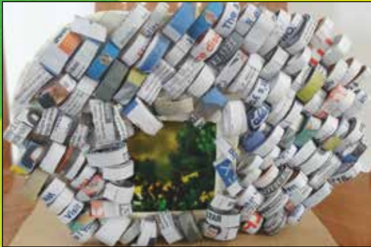
Shriya S - VII