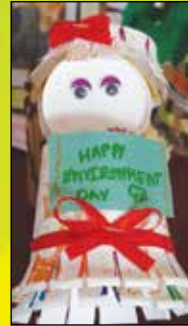
Gargi - VII