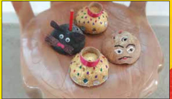
Aryan Shyam - VII