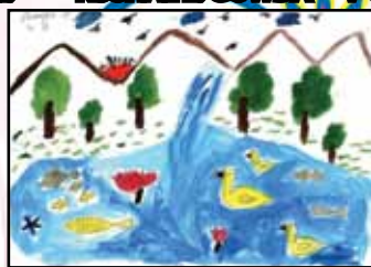
ANANYA.H - IV Std.