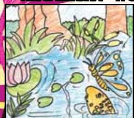
TAMARA - VI Std.