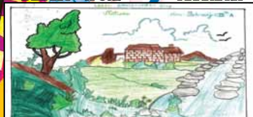
PADMARAJ .S - IV Std.