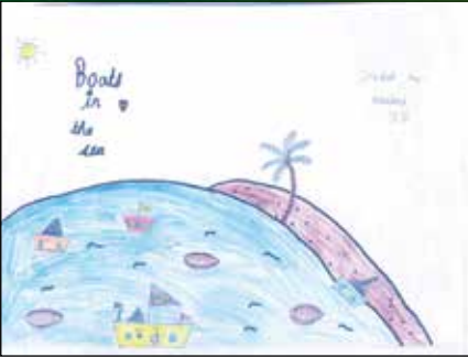
Anushree - IV