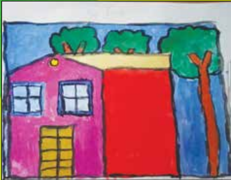
Vishrutha - III