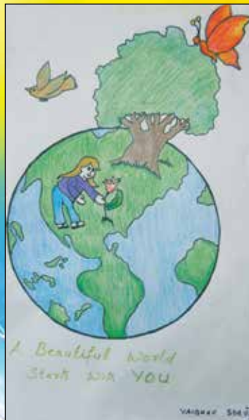
Vaibhav - VIII