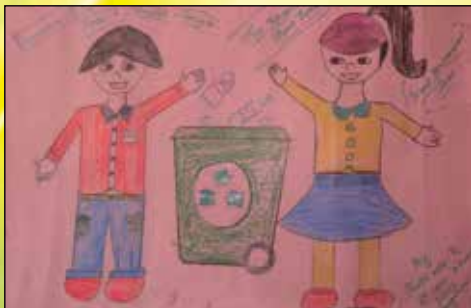
Pratiksha R - IV