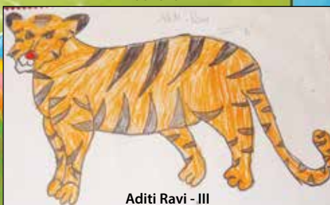
Aditi Ravi - III