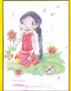
Liharrika - UKG