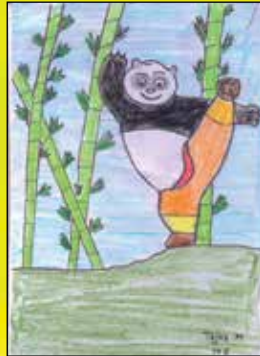
Tejus M - IV