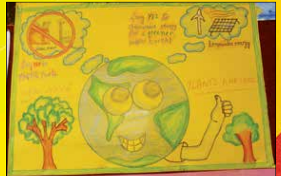
Prahlad - VIII