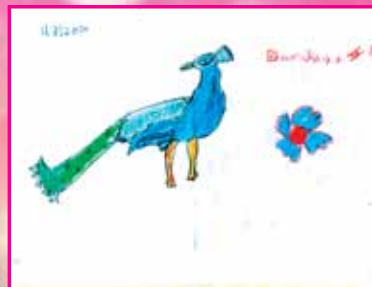
BHUMIKA.Y.A - IV

Important - Chop all the vegetables finely. Take a chapatti, keep the filling in the middle and roll the chapatti tightly and secure it with a strip of aluminum foil, so that it is easy for the child to hold in the middle and eat. Instead of sweet corn, you can add button mushrooms or paneer, but do not add all the 3 together.