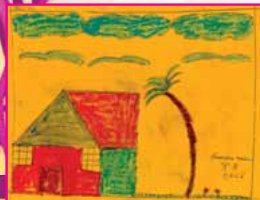
AMRUTHAVARSHINI - II