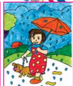
DIYA NAMBIAR - V