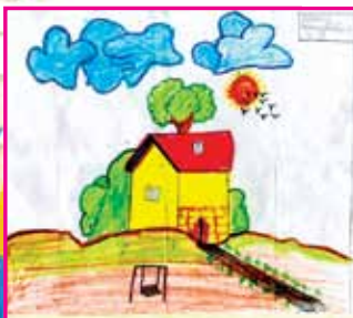
KOUSTUBHAS - IV