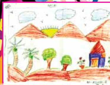
RISHABH.R - III