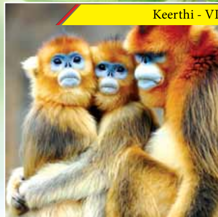
Keerthi - VI

The golden snub-nosed monkey ( Rhinopithecus roxellana ) is an Old World monkey in the Colobinae subfamily. It is endemic to a small area in temperate, mountainous forests of central and Southwest China. They inhabit these mountainous forests of Southwestern China at elevations of 1,500-3,400 m above sea level. The Chinese name is Sichuan golden hair monkey. It is also widely referred to as the Sichuan snub-nosed monkey.