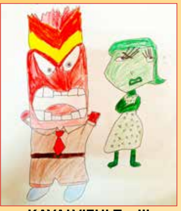
KAYALVIZHI T. - III