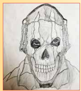
DHRUV SINGH - VIII