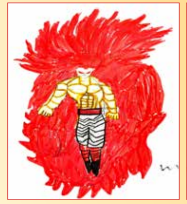
A. ALVYN - III