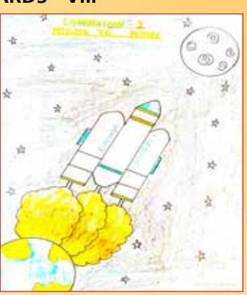
ISHANVI DEWAN - III