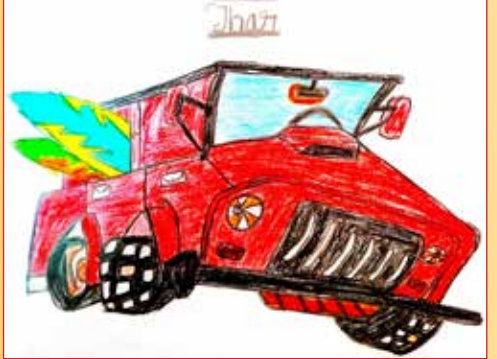
YASHAS P. N. - III