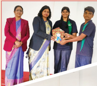
DMCS Class Prefects