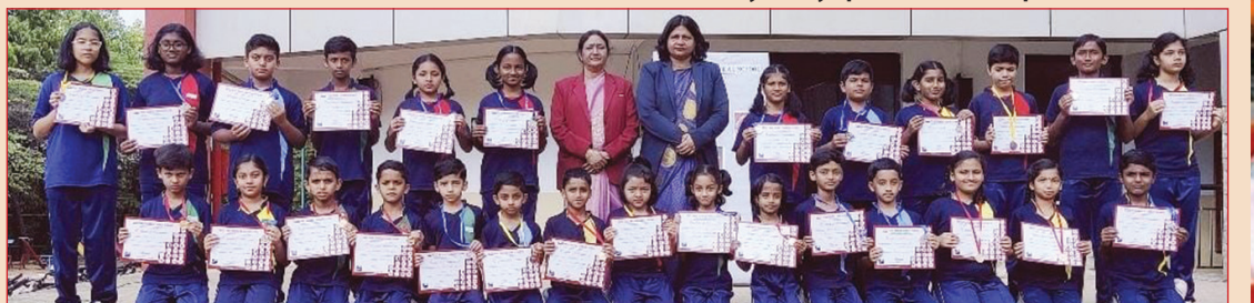
DMCS Vidyaranyapura Sports Winners