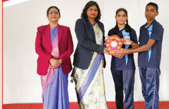
Best House Award