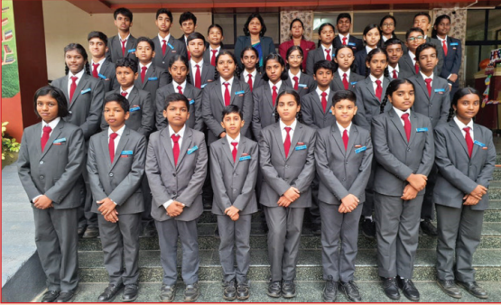
DMCS Class Prefects - VI to XII