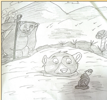
ANGELINA ANIL RAJAN - X