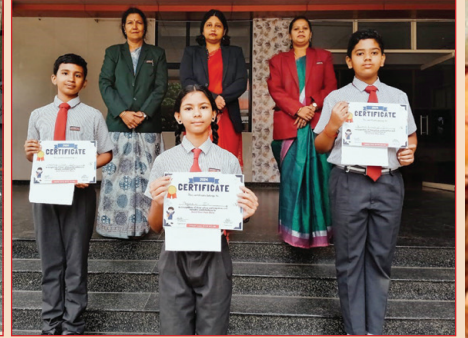
DMCS Library Award