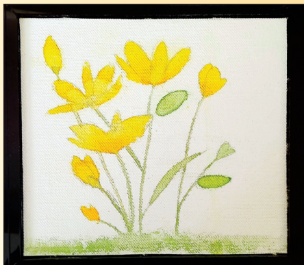
TANIA D'SILVA - VII