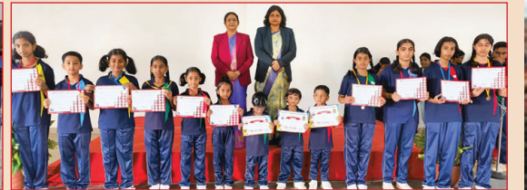
DMCS Vidyaranyapura CCA Competition Winners