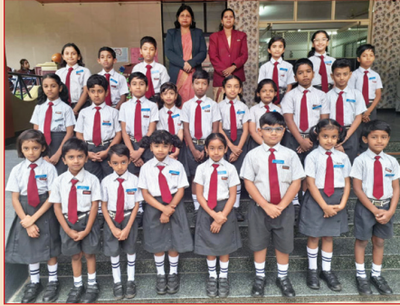
DMCS Class Prefects - I to V