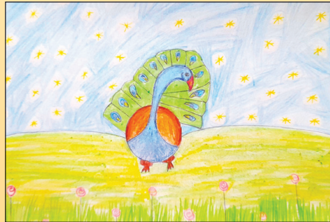
DHANYA GANESH NAIK - IV