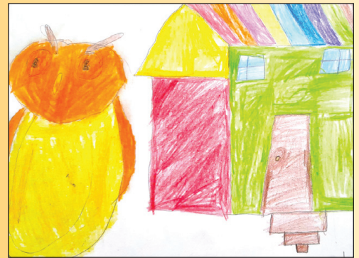
NAVYAGANESH NAIK - I