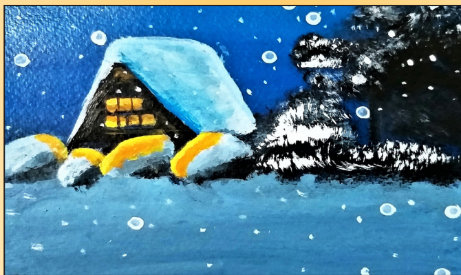
LALLITHKRISHNA S.MENON - VI