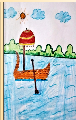
NAVYA GANESH NAIK - LKG