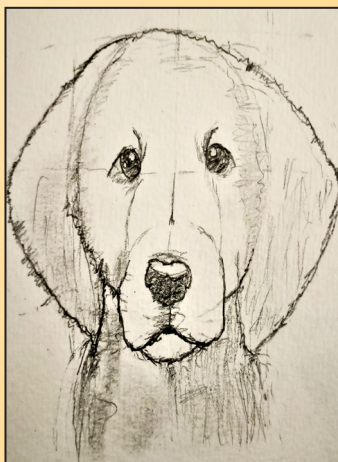
KATHIR - V