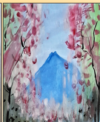
SONA KUMARI - VI