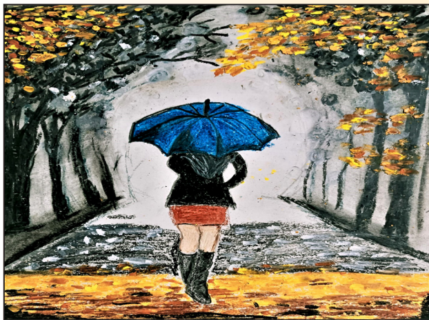
ANUSHREE V. - IX