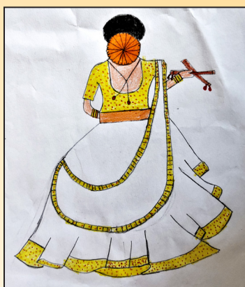
MAHALAKSHMI Y. - IV