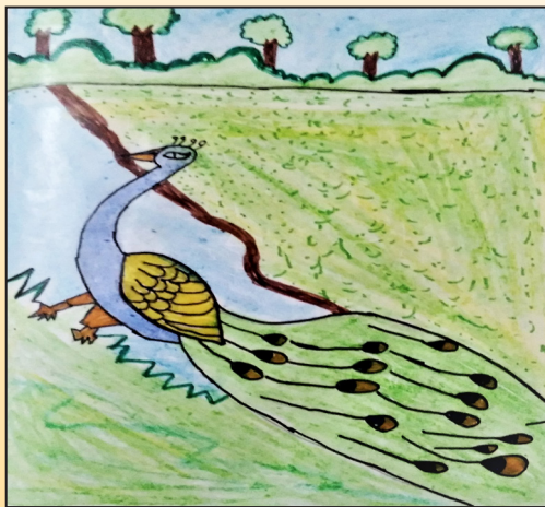
DHANYA GANESH NAIK - II