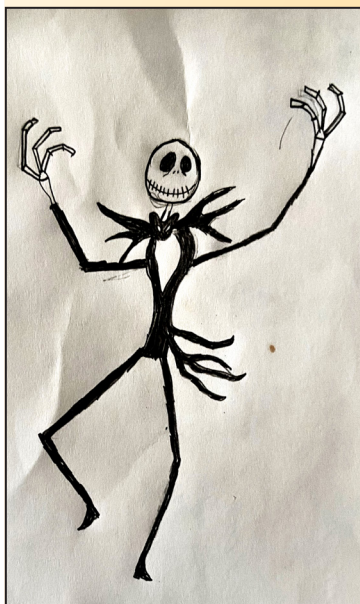
SIVA GUHAN - VI