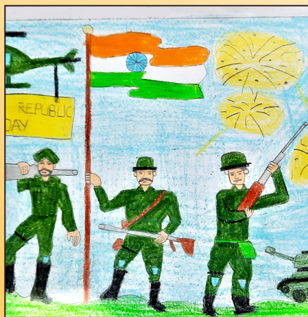
RISHON SAMUEL NORONHA - VI