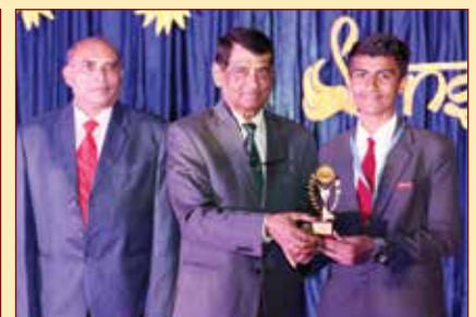
Prize Distribution & Felicitation by the Chief Guest for the DMCS Achievers