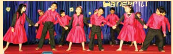
Goa Folk Dance