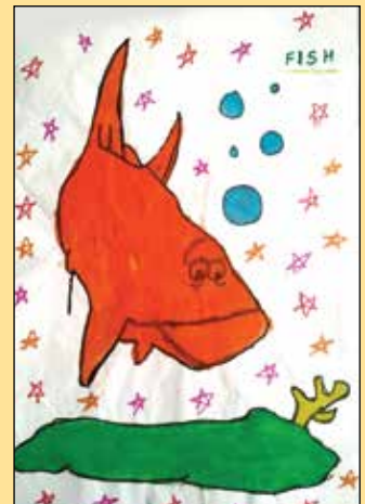
AMRUTHA GOWRI - V