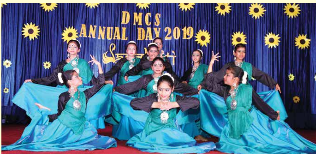
The Dazzling Invocation Dance