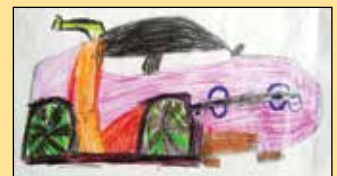
DEEPAK K. - V