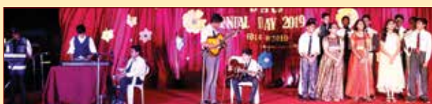
The Melodious DMCS Symphony