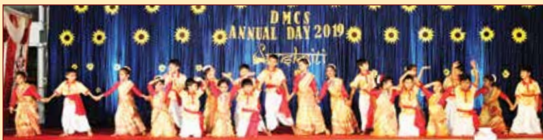
Assam Folk Dance