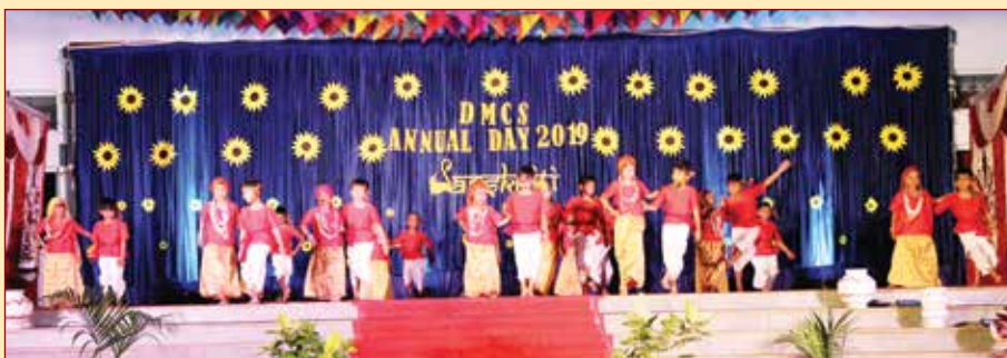
Himachal Pradesh Folk Dance