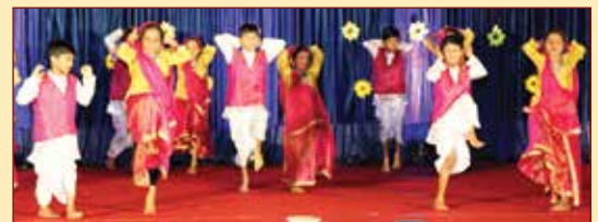
Madhya Pradesh Folk Dance