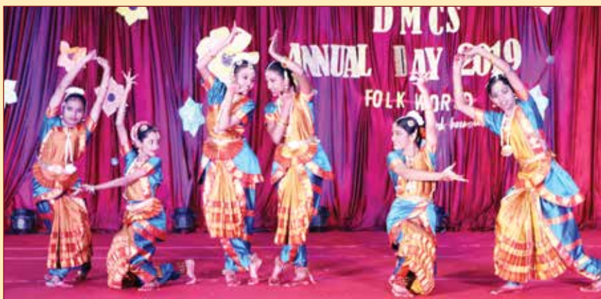
The Effervescent Invocation Dance