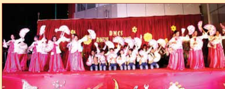
Dance Type - Korean