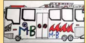
BHUVAN MULEVA - V