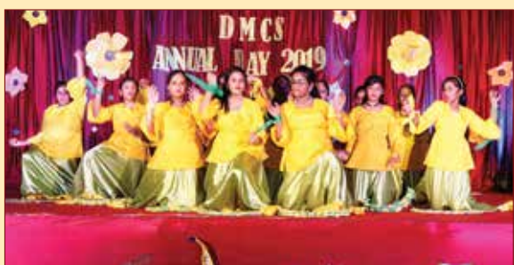
Dance Type - Filipino