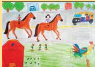
DRESHYA V. B. - VI