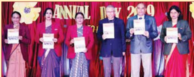
Release of the DMCS School Magazine - Gems