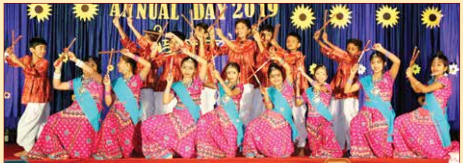
Gujarat Folk Dance