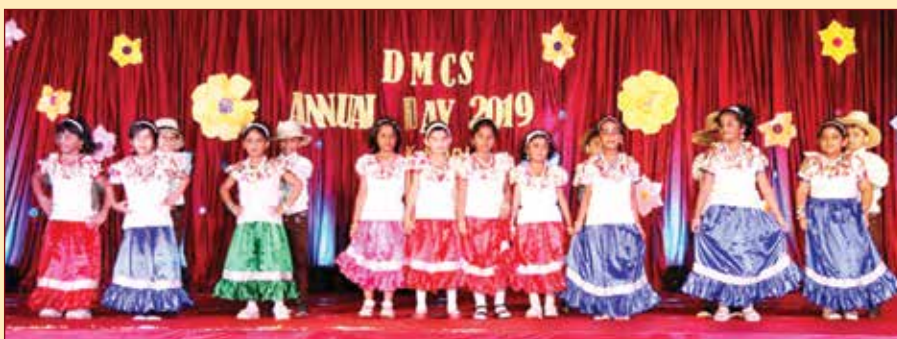
Dance Type - Mexican