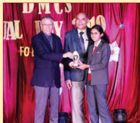
Prize Distribution & Felicitation by the Chief Guest for the DMCS Achievers