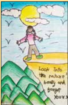
FATHIMABI - V