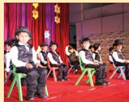
Dance Type - American