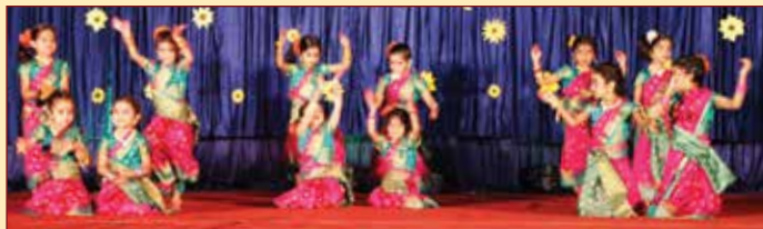
Tamil Nadu Folk Dance