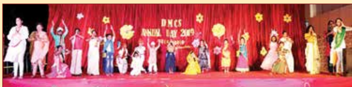
The Scintillating Fashion Show