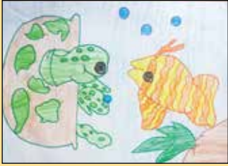
AKSHARA - III