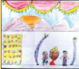
KIRTHANA N. - IV