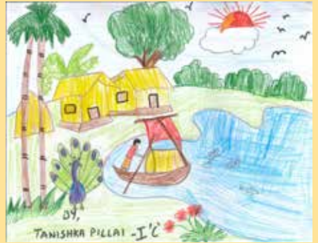
TANISHKA PILLAI - I