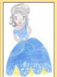
PRANAVI M. - III