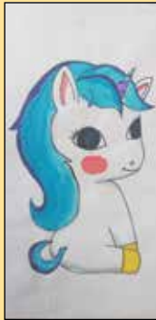
AARDHRA V. - V