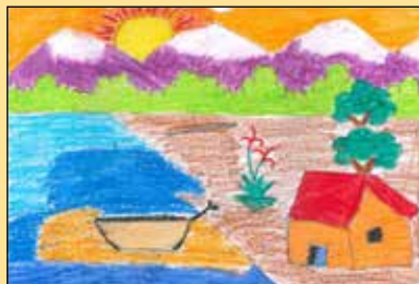
RUTHVIKA - I