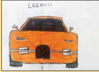
HARSHA N. - V