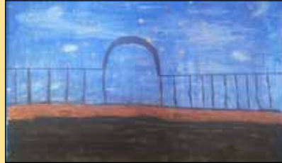
PARTHA - VI