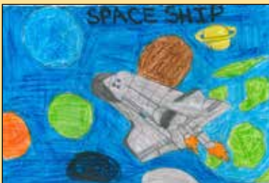
RISHON S. N. - III