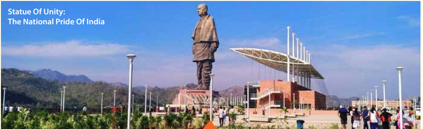
Statue Of Unity: The National Pride Of India

I vow to thee my country, All earthly things above, Entire and whole and perfect, The service of my love. - Cecil Springs Rice -