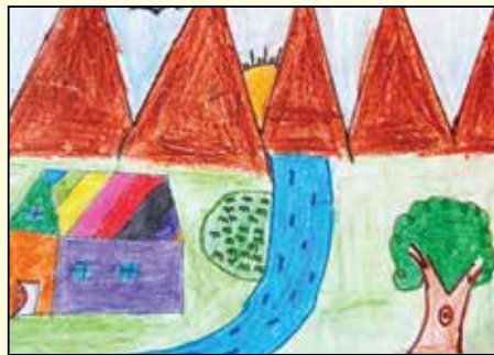
PRATHAM GOWDA - III