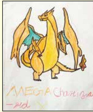
PRAJWAL GOWDA V. - III