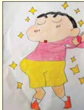
SHREEYA K. - VII