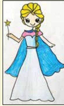
PRANATHI - III